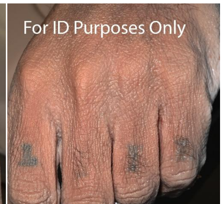
1 Overall view of the decedent's right hand tattoos and left hand tattoos.

If you recognize or believe you may be able to help identify the deceased, contact the Harris County Institute of Forensic Sciences at either number provided: